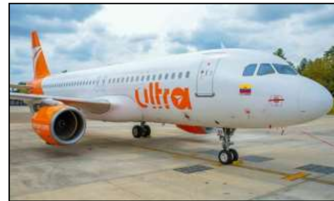
Ultra Air A320

VivaAir Colombia: ( Colombia, 2009-2023). In short, VivaAir was waiting to merge with legacy airline Avianca however the process and bureaucracy around the process was so involved and lengthy the airline had no choice but to declare bankruptcy. VivaAir said in a statement that the only way the company could fly again is by allowing it to be part of a larger, stronger, and better-capitalized group of airlines through the partnership with Avianca. Viva and Avianca have been looking to merge since last year. Interestingly, Viva Air was among the airlines quickest to recover post the Covid-19 pandemic. The airline had a fleet of 41 A320 aircraft.