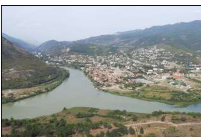
Tbilisi beckons with its picturesque Old Town,

"Classical Georgia" operating during 10-14 April 2024 covering landmarks such as Tbilisi, Kazbegi, Batumi and Martvili regions.