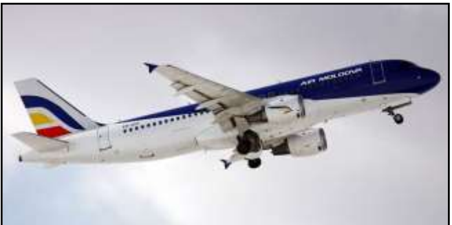
Air Moldova A320

Aeromar: ( Mexico, 1987-2023) When Aeromar declared bankruptcy they stated it had not been able to recover from financial difficulties stemming from the global downturn in travel caused by the COVID-19 pandemic starting in 2020. The Mexico City international airport said in a statement that Aeromar owed about $27.5 million in fees, services and other debts. The regional carrier operated 21 routes in Mexico and flew to McAllen and Laredo in Texas and Havana, Cuba. It specialized in flying routes between Mexico City and beach resorts. The airline had 26 ATR 42s and eight ATR 72's.